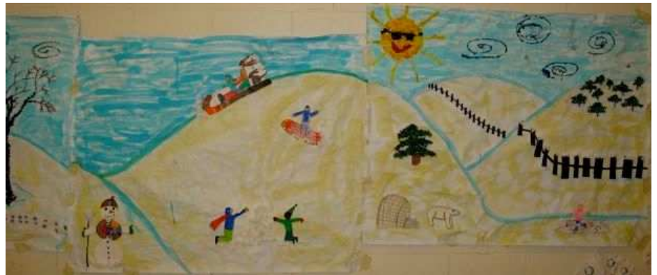
One the fantastic decorations created by Brown students for Winterfest